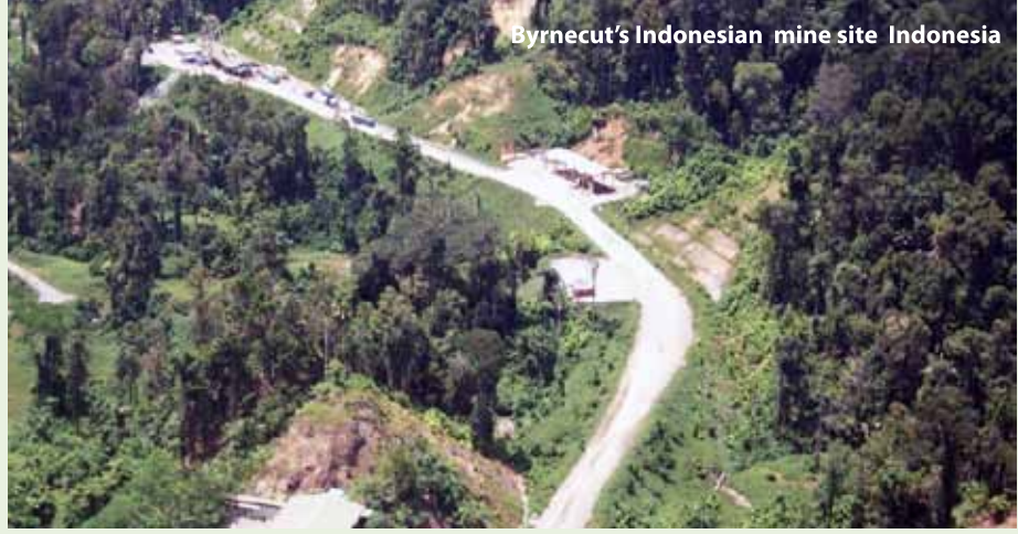
Byrnecut's Indonesian mine site Indonesia

B yrnecut Mining Pty Ltd was established in 1987 as a contract mining company. Since its inception the company has developed a reputation for professionalism and reliability.