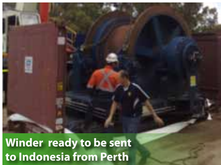
Winder ready to be sent to Indonesia from Perth