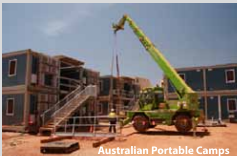
Australian Portable Camps

UnderRaps™ has been working with Australian Portable Camps as well as Ausco to achieve the environmental requirements that allow for the transportable buildings to be shipped to Barrow Island.