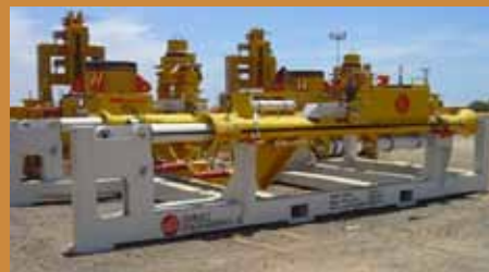
Framo sub-sea pumps Woodside Supply Base Western Australia