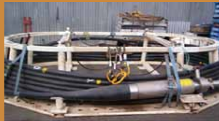
Sub-sea Umbilicals Woodside Supply Base Western Australia