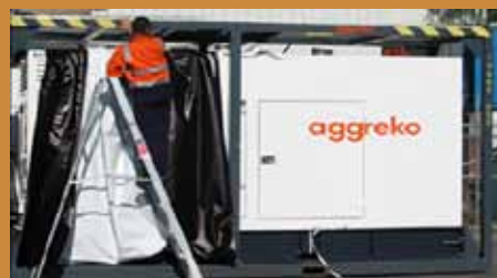
Aggreko power plant ready for shipment offshore