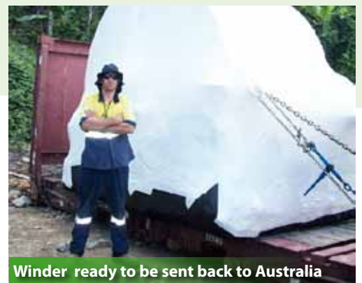
Winder ready to be sent back to Australia

The use of non chloride desiccants to control the initial dew point combined with Corrosion Intercept® packaging will act to eliminate corrosion.