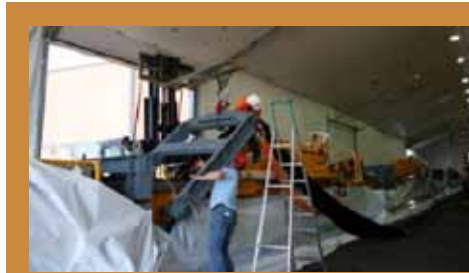
National Oilwell Hydrostacker Norway to Korea

UnderRaps™ and its agents are able to offer full cleaning, fumigation and wrapping of site preparation equipment such as cranes,