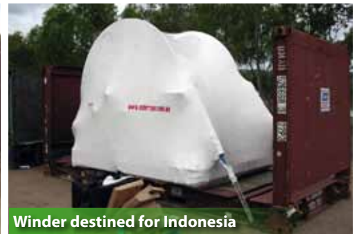
Winder destined for Indonesia