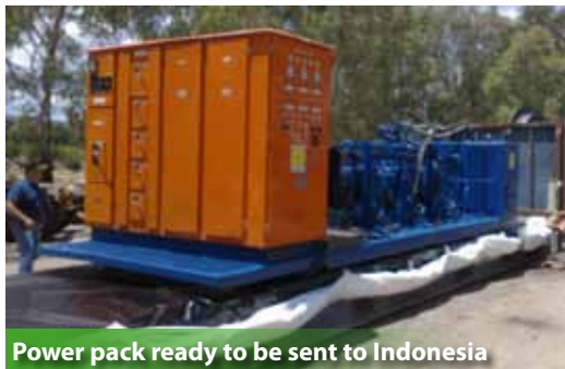
Power pack ready to be sent to Indonesia